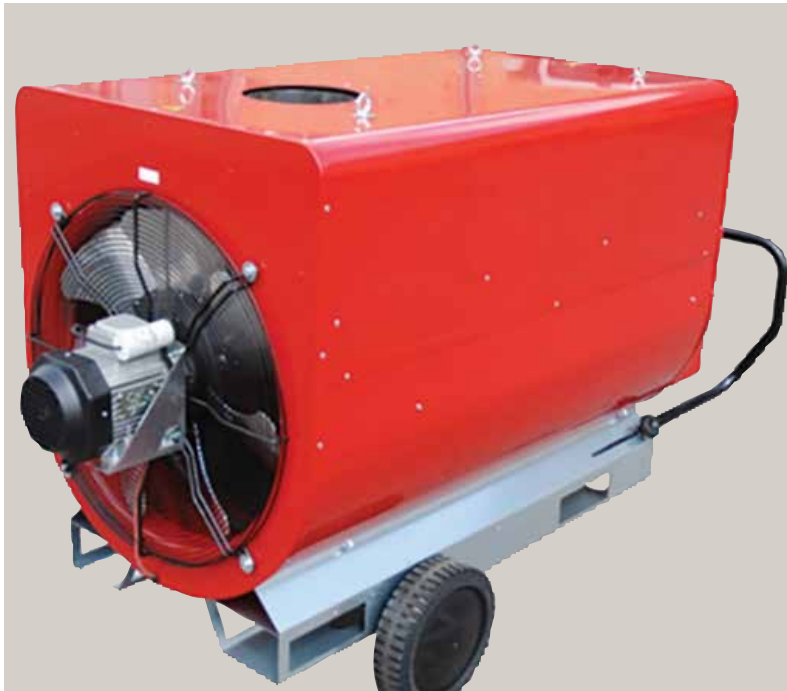
KM 160 XTG

The KGAI is especially designed for demanding environments.