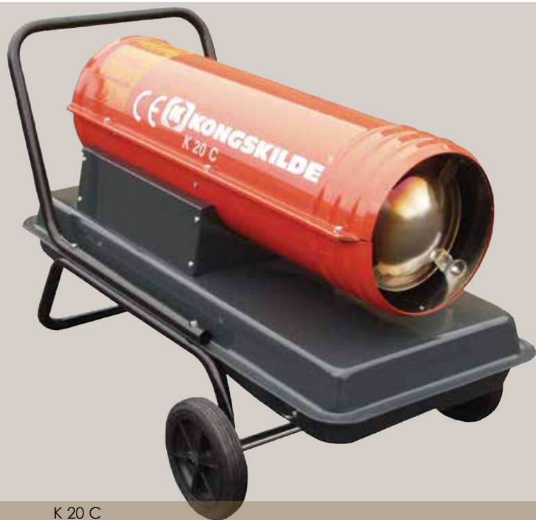
K 20 C

The Kongskilde range of direct fired heaters are designed specifically for use in ventilated areas. Their design, using the latest technology, ensures total reliability.