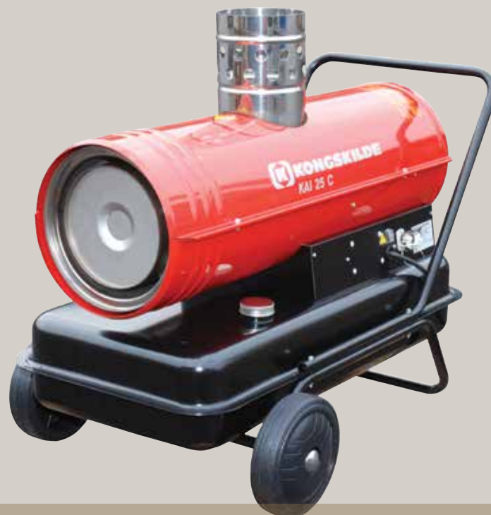
KAI 25 C

The Kongskilde KAI 25 C indirect fired heater is designed especially to provide clean hot air via the heat exchanger whilst the fumes are discharged through the vertical flue.